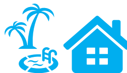
North Carolina Vacation Rental Managers Association (NCVRMA)